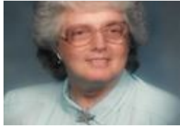
Mom, Granny, GG

“ 47 files added to the album Life Tributes